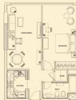
GRAND EXECUTIVE SUITE (744 sq.ft)