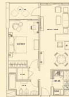
EXECUTIVE SUITE (728 sq.ft)