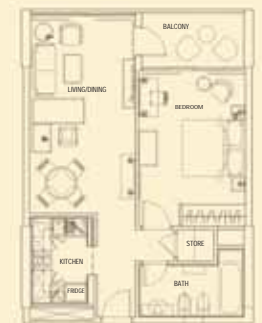
DELUXE SUITE (704 sq.ft)