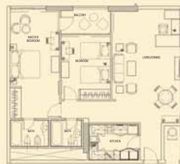
IMPERIAL SUITE (1,230 sq.ft)