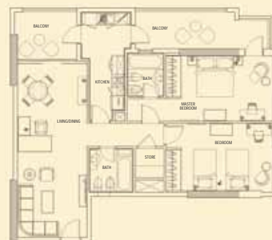
GRAND IMPERIAL SUITE (1,302 sq.ft)